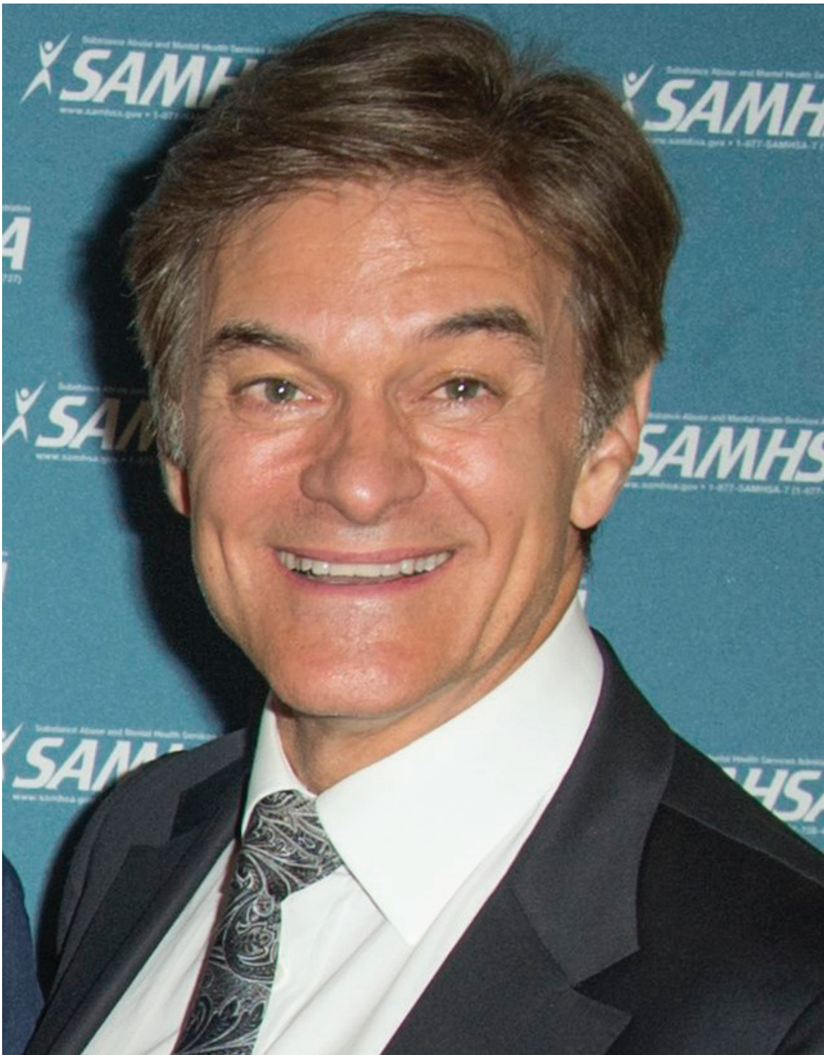
Dr. Mehmet Oz, Photo Courtesy of Wikimedia Commons

plan to cancel student debt of up to $20,000 for some people.