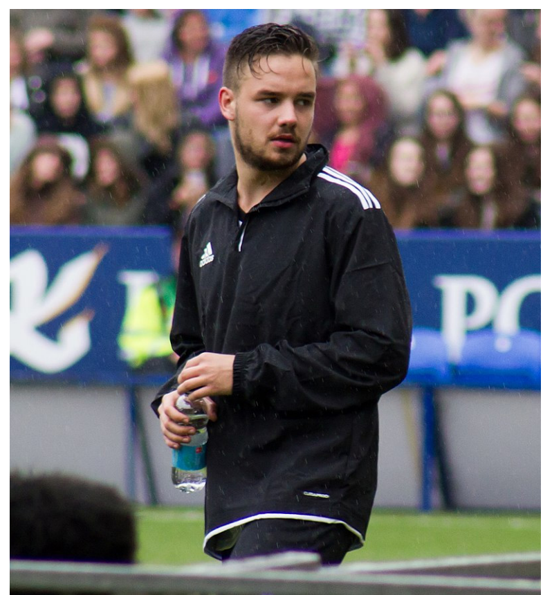
Photo courtesy of vagueonthehow from Tadcaster, York, England - Liam Payne, CC BY 2.0, https://commons.wikimedia.org/w/index.php?curid=79113543